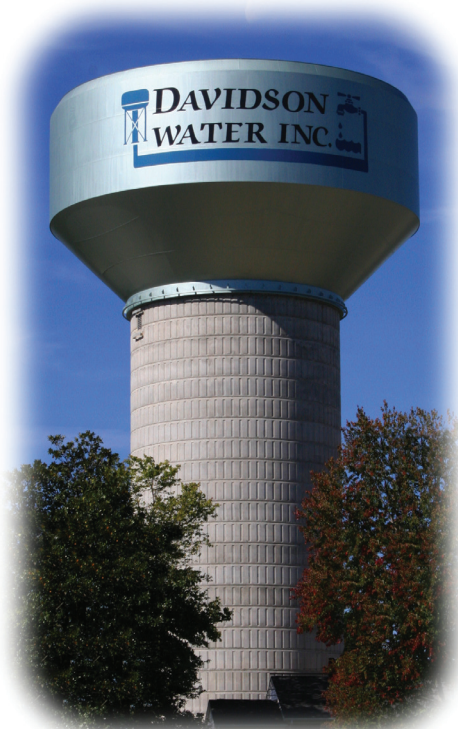
Figure 1: Davidson Inc. Water Tower

Until recently, Davidson Water had relied on Venturi flow meters to measure the produced water leaving the plant. This presented two challenges to overcome before a real audit of the system could be undertaken. First, the Venturi flow meters in operation did not offer the