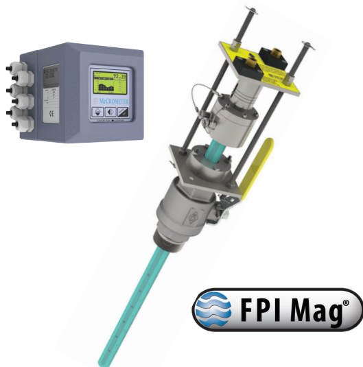
Figure 2: The FPI Mag™ Flow Meter

Davidson Water contacted W.K. Hile and the McCrometer Applications Group to review their non-revenue water loss problem and flow meter options. Davidson staff knew that in order to profile their entire system they would have to install several new meters and replace some old ones. As Robert Walters explains, "we wanted to understand what was occurring at each critical point in our system. In total, we identified 14 metering locations. This included key measurement points coming in and leaving the plant, as well as the different pressure zones in distribution." Understanding the water moving into and out of each zone helps calculate water loss.