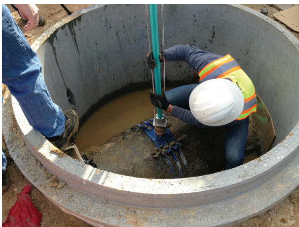
Figure 3: Installing The FPI Mag Flow Meter

Davidson Water has already been able to decrease non-revenue water loss from 16.7% to 13%. Managers are confident that unaccounted water loss will continue to decrease as more of the newly installed FPI Mag flow meters are brought into full production. As Dale Draughn concludes, “the FPI Mag flow meters are allowing us to pinpoint pressure zones with issues. Once we know we have an issue, we can break it into subzones and start a rapid street-by-street investigation.” With the results that have come in so far, it is likely the company will exceed its goal ahead of schedule.